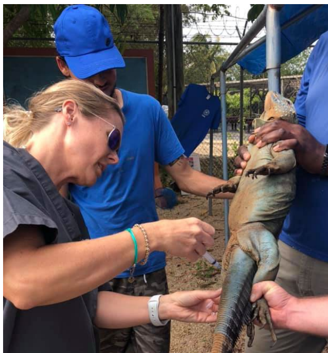
Figure 4. Annual health checks completed by an on-island team from BIC and St. Matthew's University School of Medicine, under online supervision from WCS (Bronx Zoo), November 2020.

The captive husbandry, welfare and nutritional aspects are consistently reviewed by the Operations Manager, the BIC Steering Committee and veterinarians from SMU and WCS. There have been major changes in standards since the start of this grant project, due to the application of new staff protocols and a new staff training programme. The body condition of the captive blue iguanas has been dramatically improved, as evidenced by the results of the annual health checks ( Figure 4 ), carried out with an on-island team from BIC and SMU, supported by WCS, which show that each iguana has been continually and measurably putting on weight to the present day.