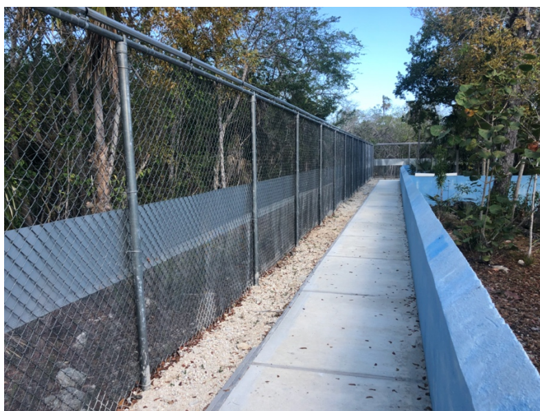
Figure 3. Alterations to the fence at the Blue Iguana Conservation facility, February 2021.

Boundary clearing was completed by BIC staff, community volunteers and labourers and any regrowth is maintained by BIC staff. Repairs and biosecurity achieved to standard as monitored by the Project Leader. Initial delays of the fence alterations and any construction were due to importation restrictions during COVID-19 (see Section 12) but all construction has now been completed at the facility.