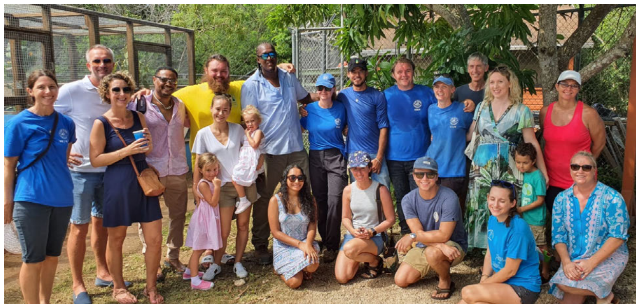
Figure 6. Group photograph of BIC staff and volunteers at the facility 'reopening' at the completion of the construction work in October 2020.

featuring construction work relating to this grant were released after July 2020, but especially at the 'reopening' of the newly renovated BIC facility in October 2020 ( Figure 6 ). The Darwin Initiative will continue to be highlighted in posts related to all aspects of this grant.