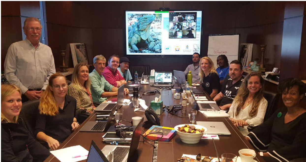
Figure 2. The on-island participants of the second SSAP meeting, Grand Cayman (with off-island participants via Zoom) in January 2021.